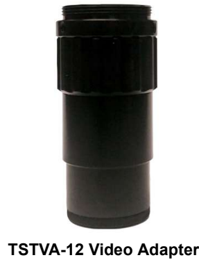
TSTVA-12 Video Adapter