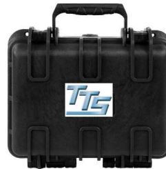
CS CENTERING SCOPE CASE