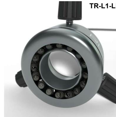
TR-L1-LED Ring Light