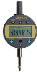
Electronic Depth Measuring Indicator Model DI-35-700-10