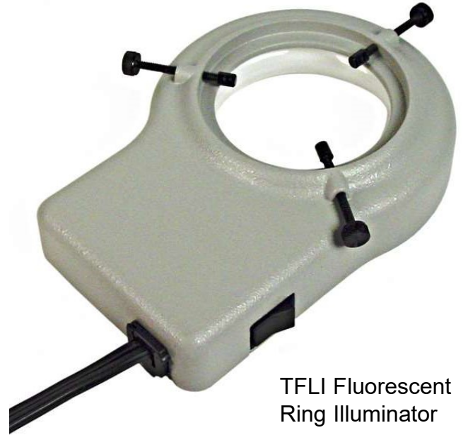
TFLI Fluorescent Ring Illuminator

Uses 120 Volt AC Adapter which is supplied with unit.