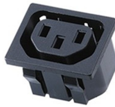
IEC C13 Plug in back of LuxPro LED Illuminator for universal use.