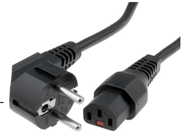
IEC C13 Power Cord shown with European Type Plug. Other Plug types for world wide use can be purchased locally with the IEC C13 plug.